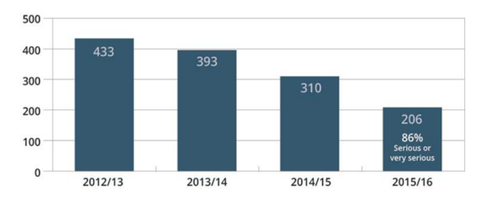
Figure 1: Number of cases (vessels)